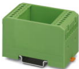
Electronic housing, for PCB insertion, without screw connection terminal blocks and cover

Please be informed that the data shown in this PDF Document is generated from our Online Catalog. Please find the complete data in the user's documentation. Our General Terms of Use for Downloads are valid ( http://phoenixcontact.com/download )