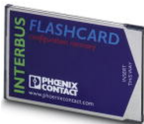
Program and configuration memory, 2 Mbyte

Please be informed that the data shown in this PDF Document is generated from our Online Catalog. Please find the complete data in the user's documentation. Our General Terms of Use for Downloads are valid ( http://phoenixcontact.com/download )