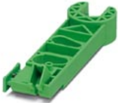
Fiber cutter for assembling polymer fiber cables for connecting INTERBUS Ruggedline devices

Please be informed that the data shown in this PDF Document is generated from our Online Catalog. Please find the complete data in the user's documentation. Our General Terms of Use for Downloads are valid ( http://phoenixcontact.com/download )