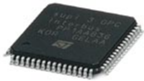
Slave protocol chip, for INTERBUS

Please be informed that the data shown in this PDF Document is generated from our Online Catalog. Please find the complete data in the user's documentation. Our General Terms of Use for Downloads are valid ( http://phoenixcontact.com/download )