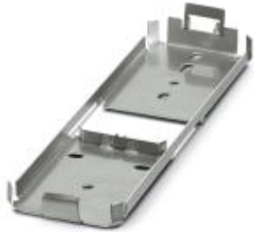
Mounting plate for Axioline E metal devices

Please be informed that the data shown in this PDF Document is generated from our Online Catalog. Please find the complete data in the user's documentation. Our General Terms of Use for Downloads are valid ( http://phoenixcontact.com/download )