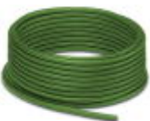
By the meter, Remote bus cable, INTERBUS, shielded, PVC, may green RAL 6017, 6-wire (3 x 2 x 0.22 mm 2 ), color single wire: Green-yellow, white-brown, gray-pink, fixed installation

Remote bus cable - IBS RBC METER-T - 2806286