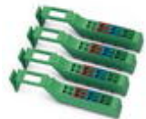
Connector set, for IB IL DI/DO 8, copper, with color print.

Connector set - IB IL DI/DO 8-PLSET/CP - 2860963