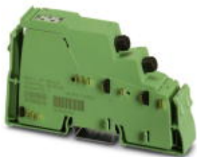
INTERBUS FO branch terminal block, without accessories, with remote bus branch, 24 V DC

Please be informed that the data shown in this PDF Document is generated from our Online Catalog. Please find the complete data in the user's documentation. Our General Terms of Use for Downloads are valid ( http://phoenixcontact.com/download )