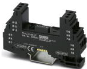
Base element for PLUGTRAB PT-IQ protective plug (5-HF, 4X1, 2X2)

Please be informed that the data shown in this PDF Document is generated from our Online Catalog. Please find the complete data in the user's documentation. Our General Terms of Use for Downloads are valid ( http://phoenixcontact.com/download )