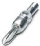
Test plugs, with solder connection up to 1 mm 2 conductor cross section, color: gray