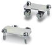
Adapter insert, type: D25

Adapter insert - HC-CIF-D25-AIWS-SM-NI - 1424341