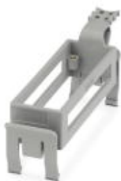
HEAVYCON DIN rail mounting frame, for type B24 contact inserts

Please be informed that the data shown in this PDF Document is generated from our Online Catalog. Please find the complete data in the user's documentation. Our General Terms of Use for Downloads are valid ( http://phoenixcontact.com/download )