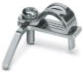
Shield connection clamp for printed circuit terminal block

Shield connection clamp - ME-SAS - 2853899