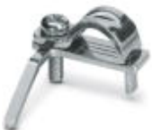
Shield connection clamp for printed circuit terminal block

Shield connection clamp - ME-SAS - 2853899