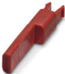
Coding profile, for coding HC-HS 2-D7-E...S, 4 coding profiles per strip (40 strips per unit pack)

Please be informed that the data shown in this PDF Document is generated from our Online Catalog. Please find the complete data in the user's documentation. Our General Terms of Use for Downloads are valid ( http://phoenixcontact.com/download )