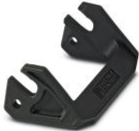
Single locking latch for B10 housing, HC-EVO...AL and HC-STA...AL

Please be informed that the data shown in this PDF Document is generated from our Online Catalog. Please find the complete data in the user's documentation. Our General Terms of Use for Downloads are valid ( http://phoenixcontact.com/download )