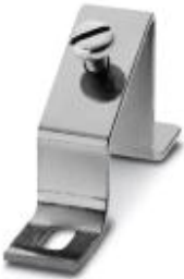
Angled brackets with M6 screw, for fixing DIN rails at an angle of 30°, height: 46 mm

Please be informed that the data shown in this PDF Document is generated from our Online Catalog. Please find the complete data in the user's documentation. Our General Terms of Use for Downloads are valid ( http://phoenixcontact.com/download )