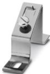
Angled brackets with M6 screw, DIN rail limit stop, for fixing DIN rails at an angle of 30°, height: 46 mm

Please be informed that the data shown in this PDF Document is generated from our Online Catalog. Please find the complete data in the user's documentation. Our General Terms of Use for Downloads are valid ( http://phoenixcontact.com/download )