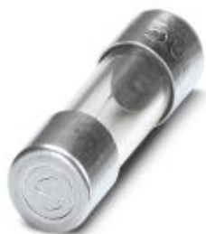
Accessories for crimping machine

Please be informed that the data shown in this PDF Document is generated from our Online Catalog. Please find the complete data in the user's documentation. Our General Terms of Use for Downloads are valid ( http://phoenixcontact.com/download )