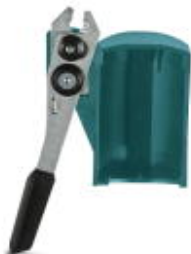
Cutting unit, for CF CRIMPHANDY, for stranded copper wires from 0.5 - 1.5 mm 2 , incl. receptacle tray

Please be informed that the data shown in this PDF Document is generated from our Online Catalog. Please find the complete data in the user's documentation. Our General Terms of Use for Downloads are valid ( http://phoenixcontact.com/download )