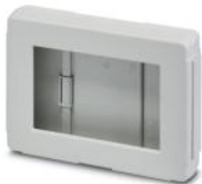
Display housing, 7", light gray, central window, front level, consisting of two half shells, four front plates with screws

Please be informed that the data shown in this PDF Document is generated from our Online Catalog. Please find the complete data in the user's documentation. Our General Terms of Use for Downloads are valid ( http://phoenixcontact.com/download )