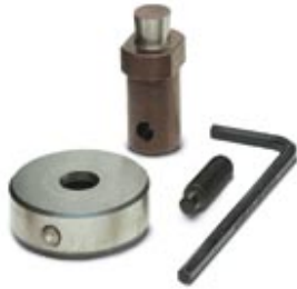
Stamping bit, for bore holes: 5.3 mm diameter

Please be informed that the data shown in this PDF Document is generated from our Online Catalog. Please find the complete data in the user's documentation. Our General Terms of Use for Downloads are valid ( http://phoenixcontact.com/download )