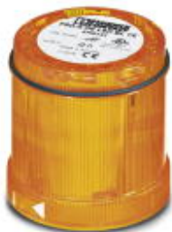
LED blinking light element, 24 V AC/DC, yellow

Please be informed that the data shown in this PDF Document is generated from our Online Catalog. Please find the complete data in the user's documentation. Our General Terms of Use for Downloads are valid ( http://phoenixcontact.com/download )