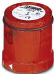
LED flashing beacon element, 24 V DC, double flash, red

Please be informed that the data shown in this PDF Document is generated from our Online Catalog. Please find the complete data in the user's documentation. Our General Terms of Use for Downloads are valid ( http://phoenixcontact.com/download )