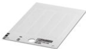
The figure shows a similar product

Snap-in markers, insert label, for marking Siemens S-7-1500 controllers, card, yellow, unmarked, can be marked with: THERMOMARK CARD, mounting type: snapped into marker carrier, lettering field size: 23 x 109 mm