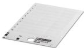
The figure shows a similar product

Snap-in markers, insert label, for marking Siemens ET 200SP controllers, card, gray, unmarked, can be marked with: THERMOMARK CARD, mounting type: snapped into marker carrier, lettering field size: 31 x 12.5 mm