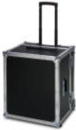
Case for the BLUEMARK CLED printer

Please be informed that the data shown in this PDF Document is generated from our Online Catalog. Please find the complete data in the user's documentation. Our General Terms of Use for Downloads are valid ( http://phoenixcontact.com/download )