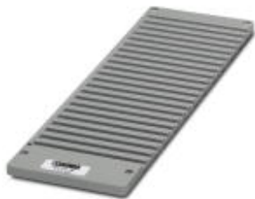
Plastic magazines for CMS-P1-PLOTTER and PLOTMARK. For accommodating 22 zack marker strips

Please be informed that the data shown in this PDF Document is generated from our Online Catalog. Please find the complete data in the user's documentation. Our General Terms of Use for Downloads are valid ( http://phoenixcontact.com/download )