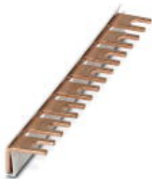
Wiring bridge for modules with connecting pitch 17.5 mm, 1-phase, 8-pos.

Please be informed that the data shown in this PDF Document is generated from our Online Catalog. Please find the complete data in the user's documentation. Our General Terms of Use for Downloads are valid ( http://phoenixcontact.com/download )