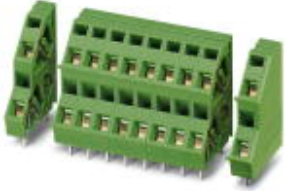
The figure shows a 10-position version

Please be informed that the data shown in this PDF Document is generated from our Online Catalog. Please find the complete data in the user's documentation. Our General Terms of Use for Downloads are valid ( http://phoenixcontact.com/download )