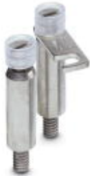
Switching jumper, pitch: 15 mm, number of positions: 2, color: silver

Please be informed that the data shown in this PDF Document is generated from our Online Catalog. Please find the complete data in the user's documentation. Our General Terms of Use for Downloads are valid ( http://phoenixcontact.com/download )