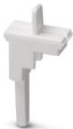
Switching lock, length: 12 mm, width: 8.2 mm, color: white

Please be informed that the data shown in this PDF Document is generated from our Online Catalog. Please find the complete data in the user's documentation. Our General Terms of Use for Downloads are valid ( http://phoenixcontact.com/download )