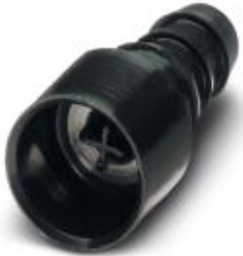
Pneumatic socket with valve, for HC-M-PN2 module, internal hose diameter of 6.0 mm

Please be informed that the data shown in this PDF Document is generated from our Online Catalog. Please find the complete data in the user's documentation. Our General Terms of Use for Downloads are valid ( http://phoenixcontact.com/download )