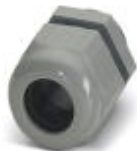
Cable gland, cable gland material: PA, external cable diameter 11 mm ... 17 mm, shielding: no, connecting thread: M25 x 1.5, color: silver-gray RAL 7001

Cable gland - G-INS-M25-M68N-PNES-GY - 1411126