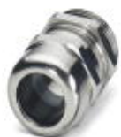
Cable gland, cable gland material: Nickel-plated brass, external cable diameter 11 mm ... 17 mm, shielding: no, connecting thread: M25 x 1.5, color: silver, with O-ring

Cable gland - G-INS-M25-M68N-NNES-S - 1411165