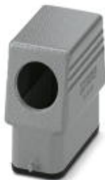
HEAVYCON sleeve housing, D15, for single locking latch, height: 66 mm, without 1 x M25 support, lateral cable outlet

Please be informed that the data shown in this PDF Document is generated from our Online Catalog. Please find the complete data in the user's documentation. Our General Terms of Use for Downloads are valid ( http://phoenixcontact.com/download )