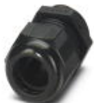
Cable gland, cable gland material: PA, external cable diameter 11 mm ... 17 mm, shielding: no, connecting thread: M25 x 1.5, color: jet black RAL 9005

Cable gland - G-INS-M25-M68N-PNES-BK - 1411134