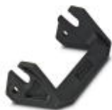
Single locking latch for B16 housing, HC-EVO....AL and HC-STA....AL

Replacement part - HC-STA-B16-SL-PLBK - 1412284