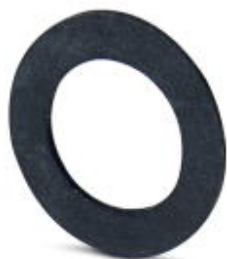
Photovoltaic connector, Seal

Please be informed that the data shown in this PDF Document is generated from our Online Catalog. Please find the complete data in the user's documentation. Our General Terms of Use for Downloads are valid ( http://phoenixcontact.com/download )