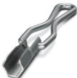
Allen wrench, for loosening and fastening the QUICKON union nut, WAF 27 mm

Please be informed that the data shown in this PDF Document is generated from our Online Catalog. Please find the complete data in the user's documentation. Our General Terms of Use for Downloads are valid ( http://phoenixcontact.com/download )