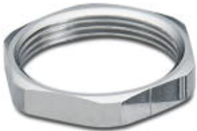
M18 x 0.75 locking nut

Please be informed that the data shown in this PDF Document is generated from our Online Catalog. Please find the complete data in the user's documentation. Our General Terms of Use for Downloads are valid ( http://phoenixcontact.com/download )