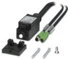
Door position switch with 1 m cable with M8 plug and 0.6 m cable with M8 socket (Snap-in), including mounting accessories

Please be informed that the data shown in this PDF Document is generated from our Online Catalog. Please find the complete data in the user's documentation. Our General Terms of Use for Downloads are valid ( http://phoenixcontact.com/download )