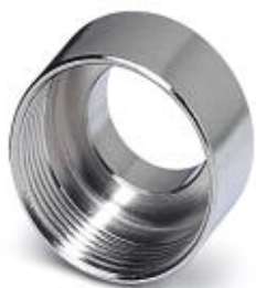
Step-up adapter, M25 to M32, including O-ring

Please be informed that the data shown in this PDF Document is generated from our Online Catalog. Please find the complete data in the user's documentation. Our General Terms of Use for Downloads are valid ( http://phoenixcontact.com/download )