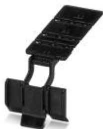
Universal wire holding bracket, perforated, for wiring channels

Please be informed that the data shown in this PDF Document is generated from our Online Catalog. Please find the complete data in the user's documentation. Our General Terms of Use for Downloads are valid ( http://phoenixcontact.com/download )