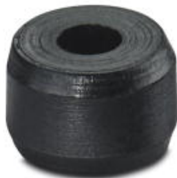
Fixing rings, for presetting the processing tools

Please be informed that the data shown in this PDF Document is generated from our Online Catalog. Please find the complete data in the user's documentation. Our General Terms of Use for Downloads are valid ( http://phoenixcontact.com/download )