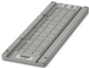
Magazine, for CMS-P1-PLOTTER, for accommodating UC-WMC 4.4...

Please be informed that the data shown in this PDF Document is generated from our Online Catalog. Please find the complete data in the user's documentation. Our General Terms of Use for Downloads are valid ( http://phoenixcontact.com/download )