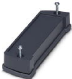
Profile housing, length: 15 mm, Side part, color: gray, width: 124.4 mm, height: 36.2 mm

Please be informed that the data shown in this PDF Document is generated from our Online Catalog. Please find the complete data in the user's documentation. Our General Terms of Use for Downloads are valid ( http://phoenixcontact.com/download )