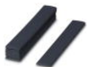
Decorative strip for HC-ALU panel mounting base

Mounting material - HC-ALU 6 DECO 150 GY - 2200915