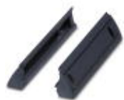
Mounting foot for panel mounting the HC-ALU panel mounting base

Mounting material - HC-ALU 6 MOUNT 150 GY - 2200912