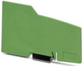
Inline end cover plate

Please be informed that the data shown in this PDF Document is generated from our Online Catalog. Please find the complete data in the user's documentation. Our General Terms of Use for Downloads are valid ( http://phoenixcontact.com/download )