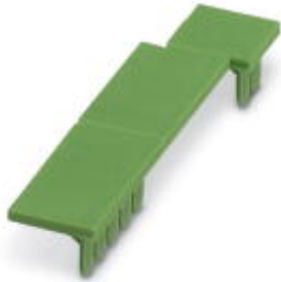
Terminal cover, 1 strip covers up to 12 terminal points, for ME-BUS terminal opening, (male side)

Please be informed that the data shown in this PDF Document is generated from our Online Catalog. Please find the complete data in the user's documentation. Our General Terms of Use for Downloads are valid ( http://phoenixcontact.com/download )