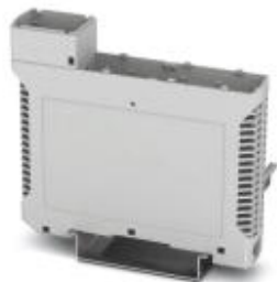
Housing base, for 50/40 bus connector, color: light gray

Please be informed that the data shown in this PDF Document is generated from our Online Catalog. Please find the complete data in the user's documentation. Our General Terms of Use for Downloads are valid ( http://phoenixcontact.com/download )