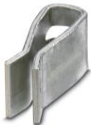
Contact fork for PCB assembly, solder pin length: 7.1 mm

Please be informed that the data shown in this PDF Document is generated from our Online Catalog. Please find the complete data in the user's documentation. Our General Terms of Use for Downloads are valid ( http://phoenixcontact.com/download )