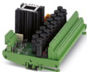
16-channel analog input module with screw connection, redundant voltage supply, and additional jumpers for each channel. Suitable for Yokogawa SAI 143 card.

Please be informed that the data shown in this PDF Document is generated from our Online Catalog. Please find the complete data in the user's documentation. Our General Terms of Use for Downloads are valid ( http://phoenixcontact.com/download )