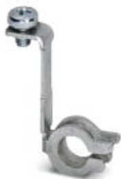
PE contact for UM-PRO panel mounting base for connecting the PCB to the DIN rail at level 3

Please be informed that the data shown in this PDF Document is generated from our Online Catalog. Please find the complete data in the user's documentation. Our General Terms of Use for Downloads are valid ( http://phoenixcontact.com/download )